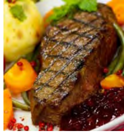
Boneless Kansas City Strip