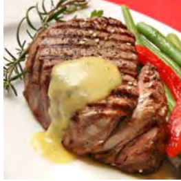
Boneless Filet of Beef Tenderloin

Delivered for only $6.95 in MO, KS, IA, and NE. Only $9.95 more for anywhere else in the continental U.S. Extra charge for AK & HI.