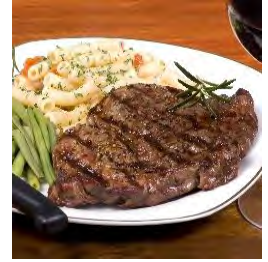
Boneless Ribeye Steak